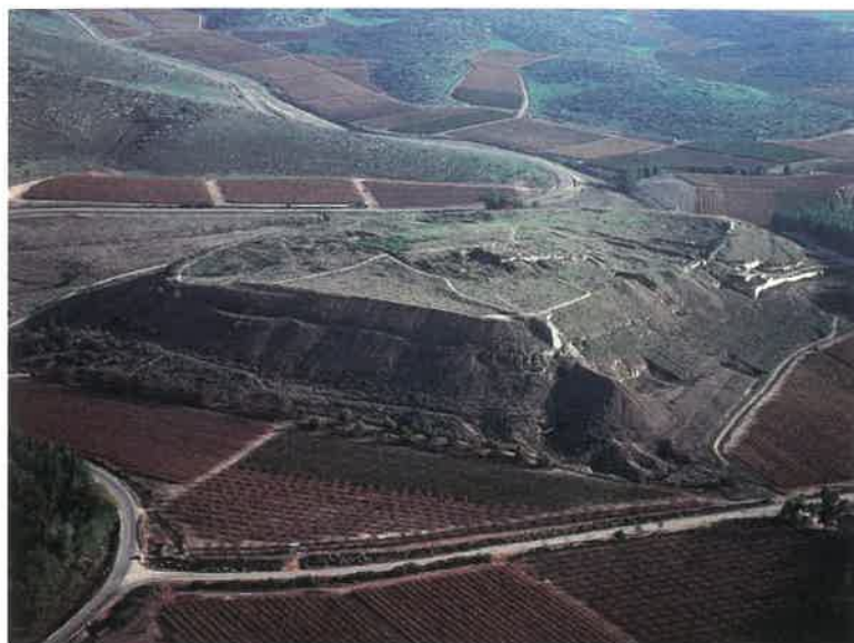
Dig Site in Lachish, Israel

S outhern's Institute of Archaeology will join the Hebrew University of Jerusalem to direct excavations at Tel Lachish in southern Israel this summer. After the capital, Jerusalem, Lachish